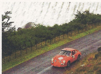
De Vargas Machuca/Bourke Porsche 911S