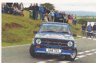
Sideways to victory: Solloway drifts Escort