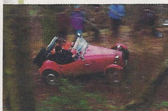
CHARLIE WOODING/STEVE WELSH