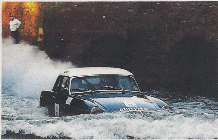
Deep ford with a restart at Bury was an early challenge for winning Godfrey/Awde MGB